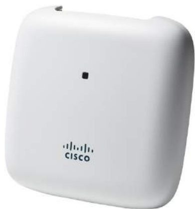
Figure 1. Cisco Aironet 1815m

With the increased coverage area, 802.11ac Wave 2 support, and the functions and features of an enterprise-level access point, the 1815m fully meets the growing requirements of wireless networks by delivering a better user experience (Figure 1).