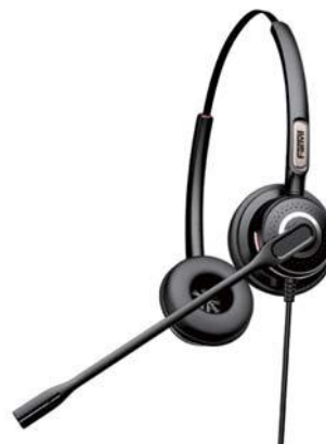
Fanvil - HT202